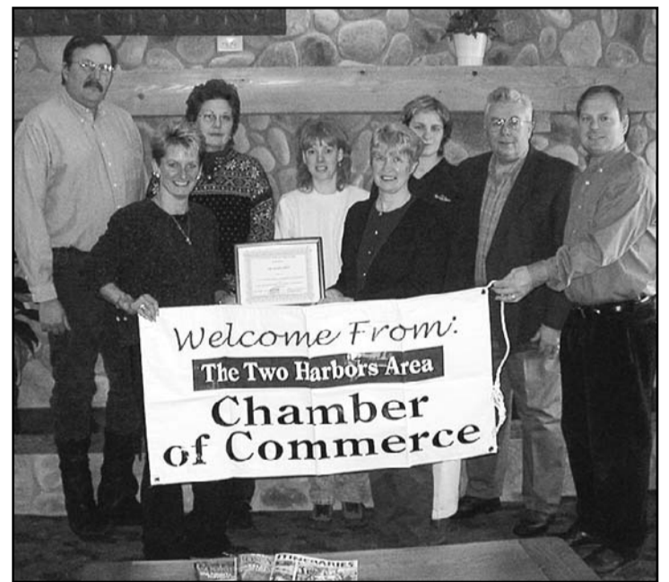
The Wells Fargo offices in Silver Bay became members of the Two Harbors Chamber of Commerce.