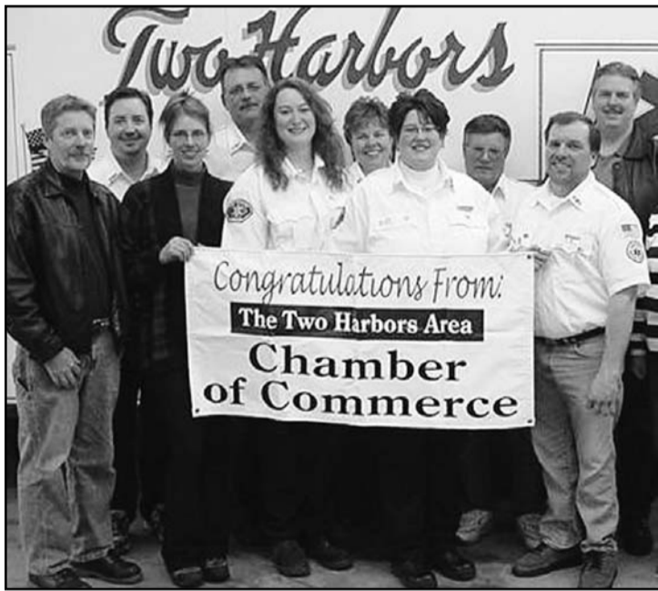
The Two Harbors Area Chamber of Commerce welcomed the Two Harbors Ambulance Service into the chamber at a recent meeting.